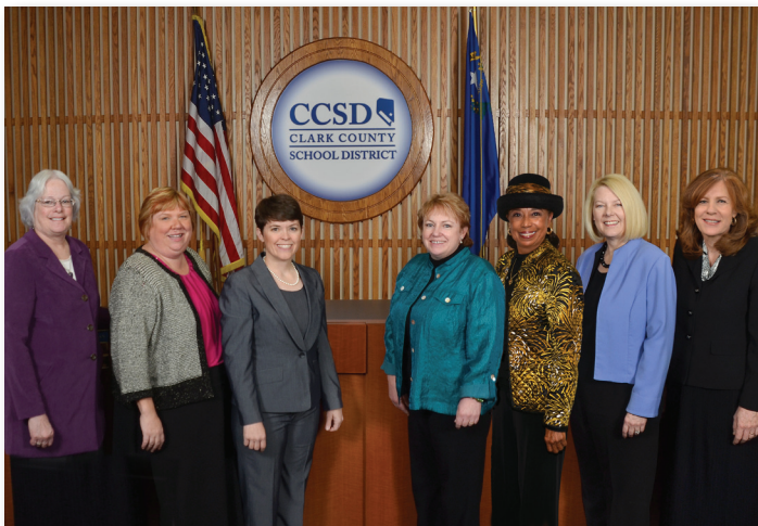
Board of Trustees

5100 West Sahara Avenue Las Vegas, NV 89146